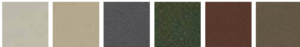
Mediterraneo Col. 2